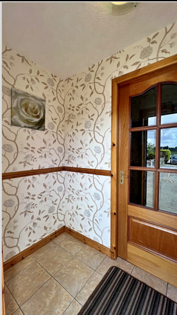
Entrance Porch - 1.14m x 2.00m