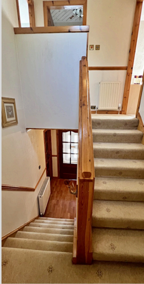
Landing - 2.92m x 1.98m