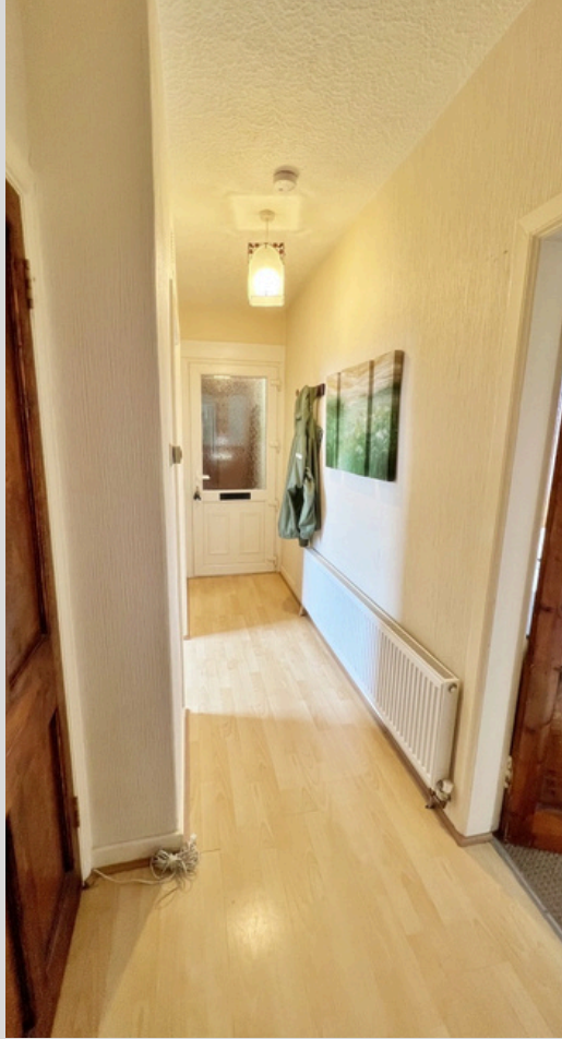
Hallway - 3.85m x 1.26m