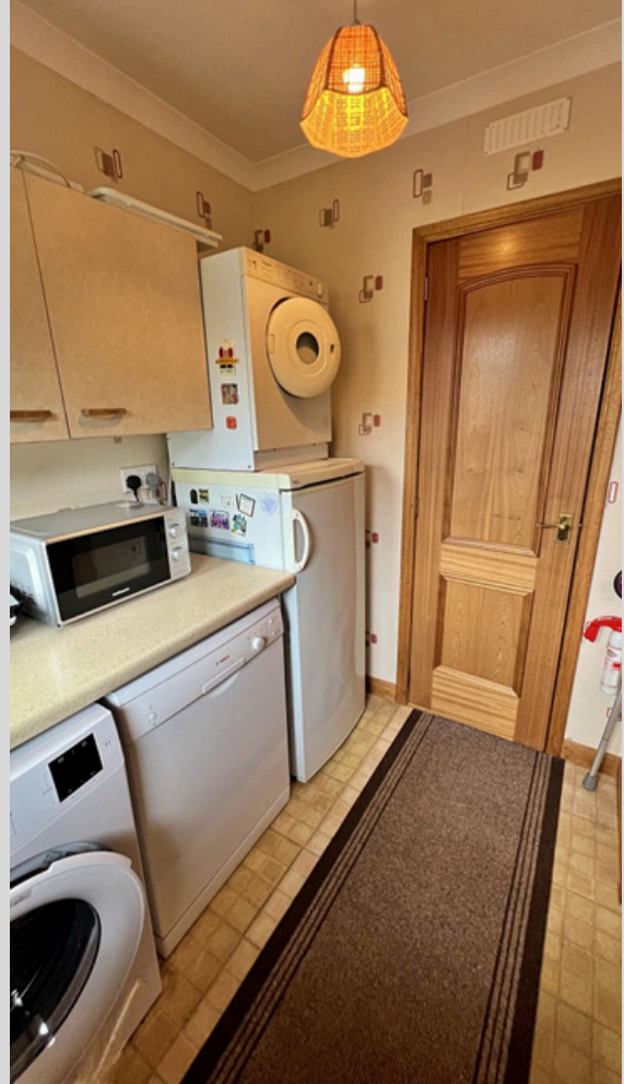
Hallway - 4.35m x 3.88m