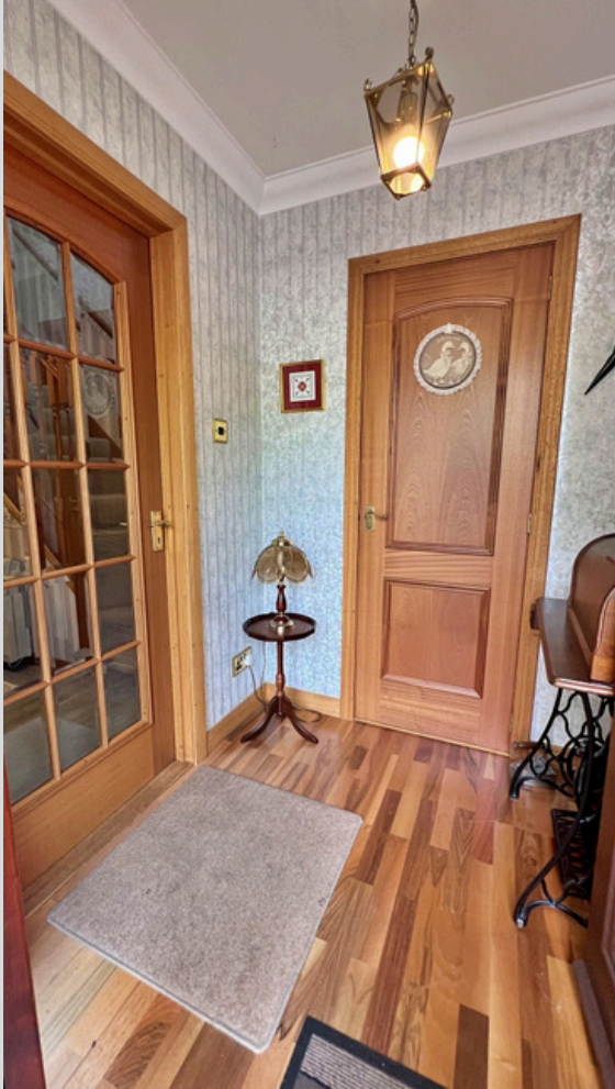
Porch - 1.67m x 1.65m Rear Porch - 1.69m x 2.04m