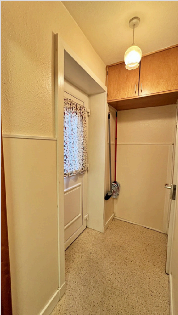
Porch - 1.74m x 0.90m