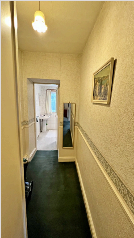
Hallway - 2.53m x 1.26m