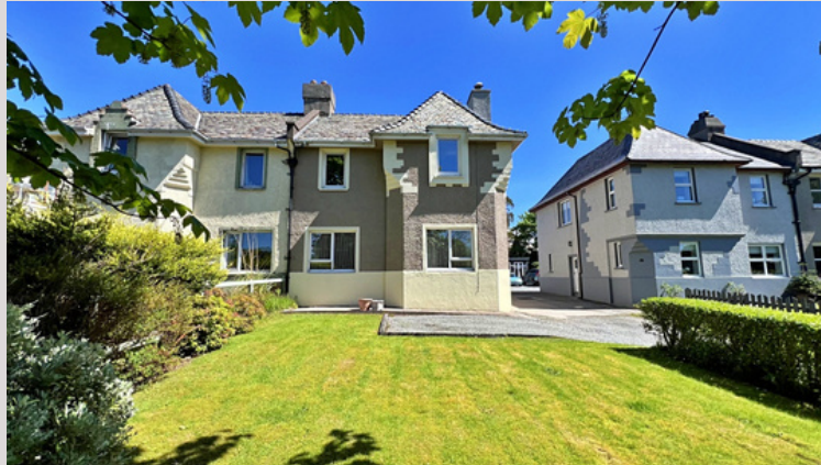
Garage - 5.50m x 2.85m