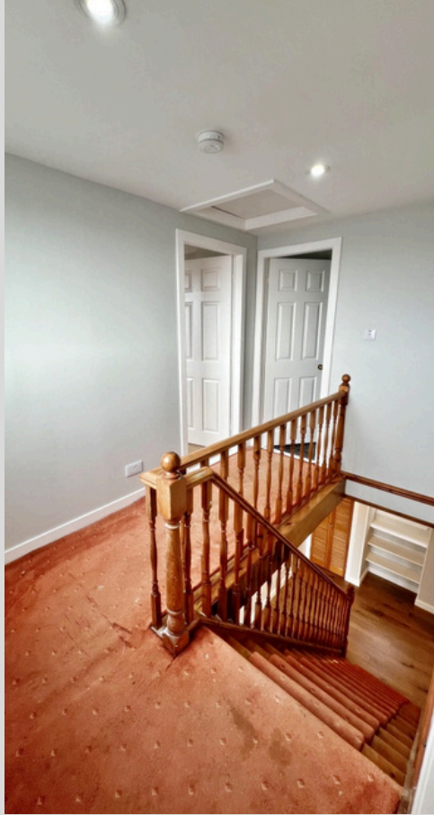
Landing - 2.00m x 3.05m