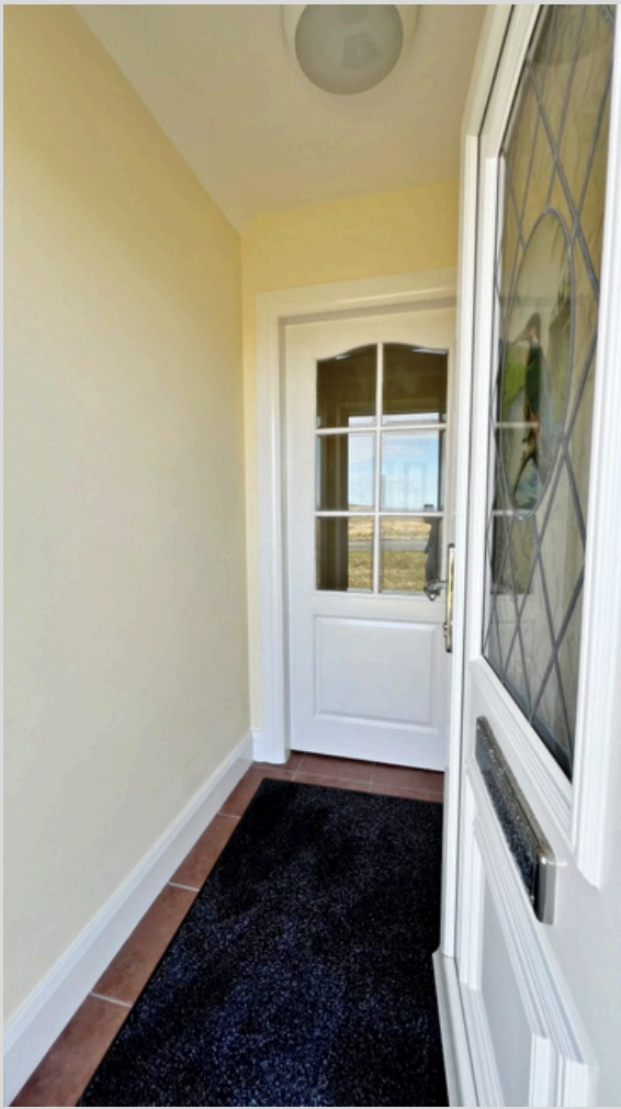
Entrance Porch - 1.15m x 1.46m