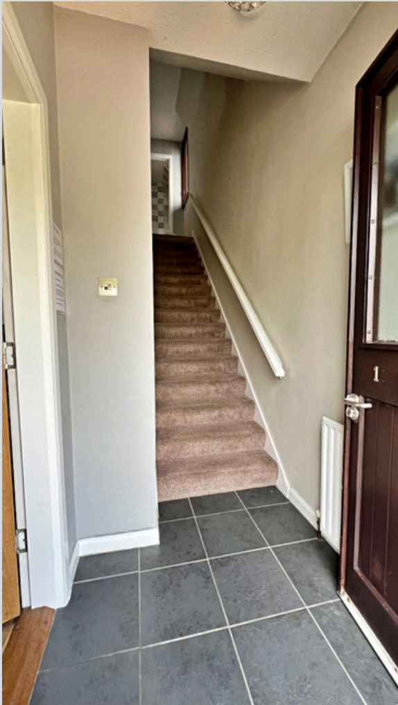
Entrance - 1.33m x 6.34m