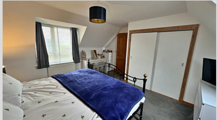
Bedroom 2 - 3.05m x 3.98m