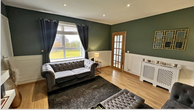
Lounge - 4.09m x 4.05m