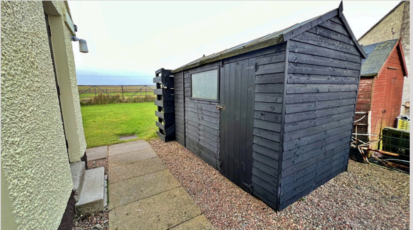
External Store - 1.20m x 1.85m