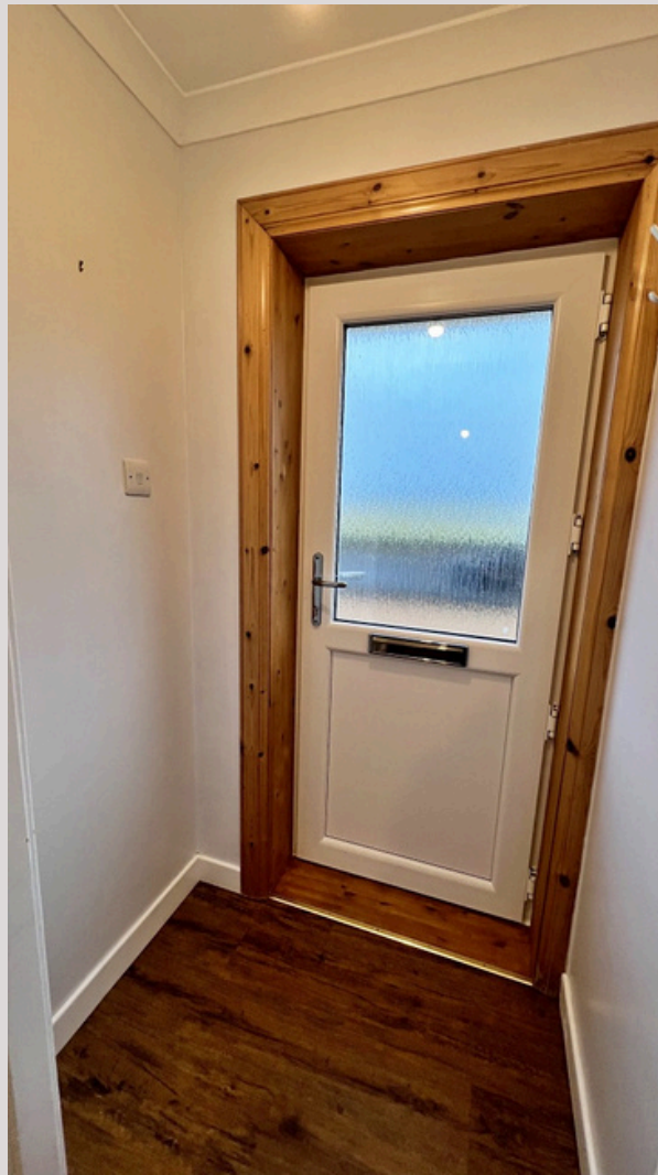
Hallway - 2.76m x 0.91m x 2.82m x 1.26m