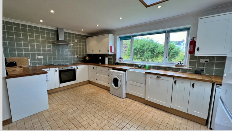
Kitchen - 2.93m x 5.12m