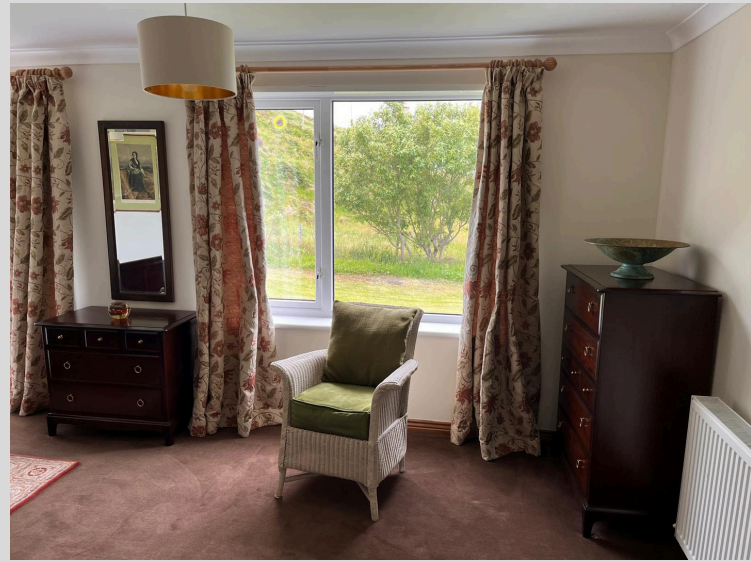
Bedroom 2 - 3.93m x 4.06m