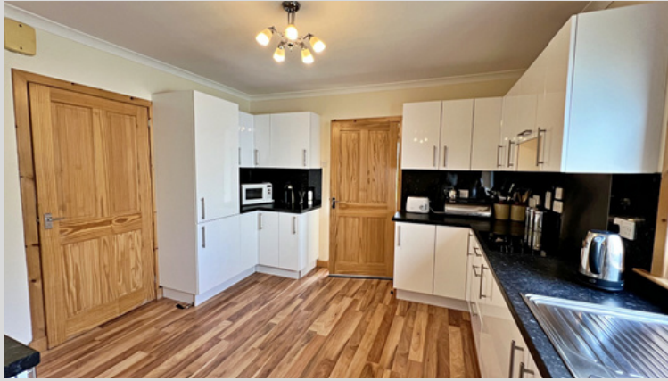
Kitchen/Diner - 6.19m x 3.63m