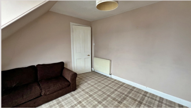
Bedroom - 3.85m x 3.24m