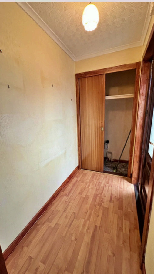
Entrance - 1.98m x 1.19m