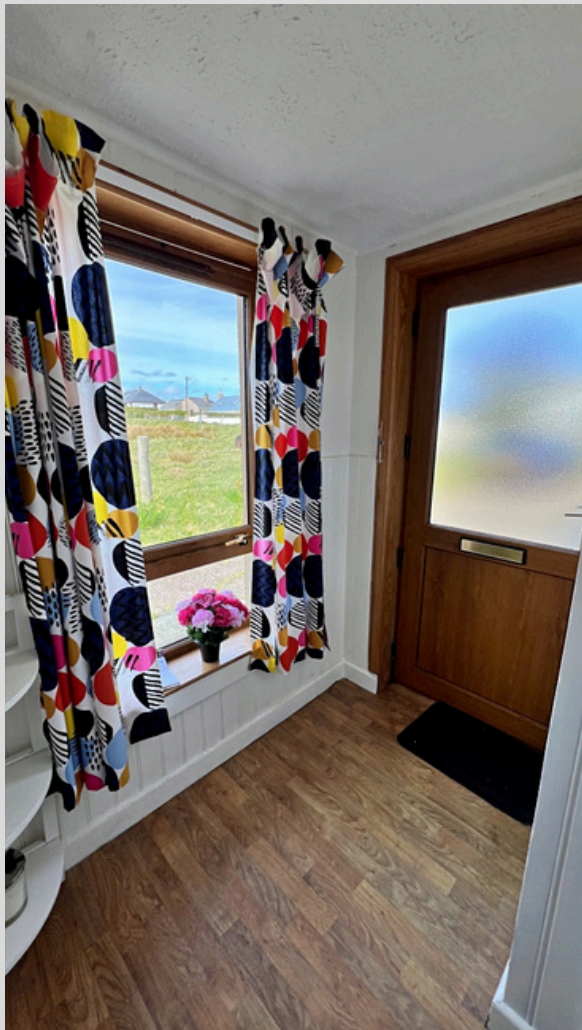
Rear Porch - 1.29m x 1.88m Entrance Porch - 0.79m x 1.39m