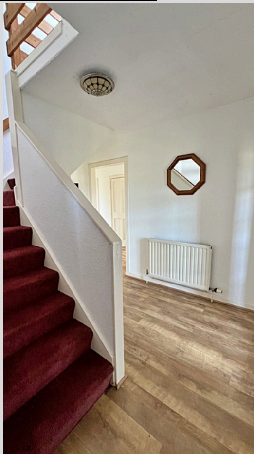
Hallway - 4.29m x 1.38m