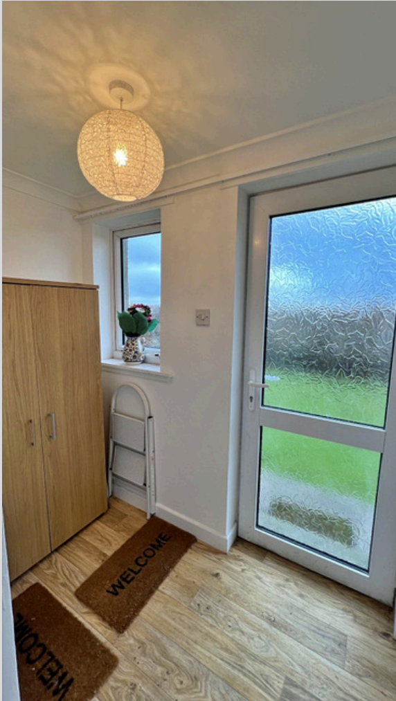
Entrance Porch - 2.17m x 1.32m