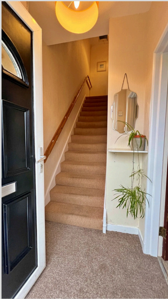
Entrance - 1.32m x 5.52m