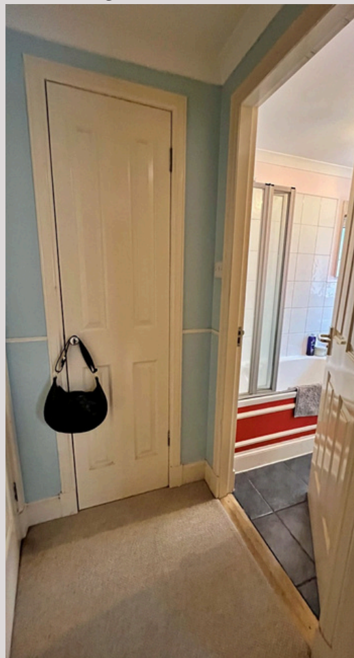
Hallway - 1.05m x 1.05m