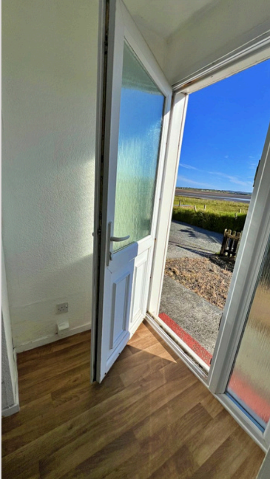
Entrance - 1.46m x 1.10m