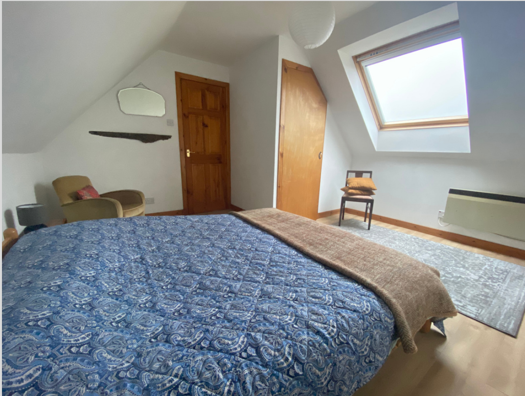
Bedroom 3 - 3.43m x 3.99m