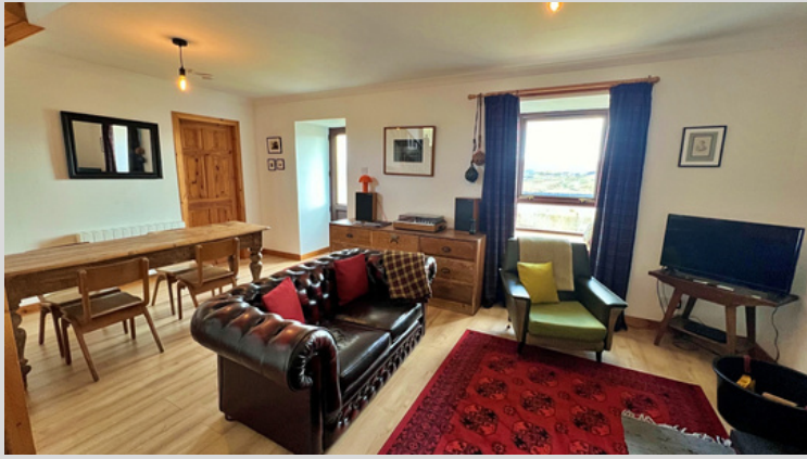
Lounge - 5.84m x 3.98m