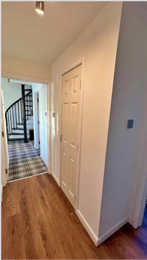
Hall - 2.47m x 1.53m