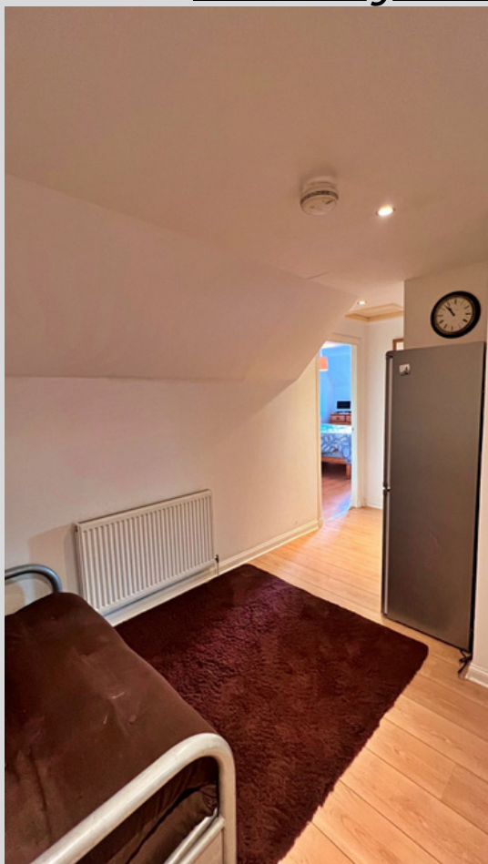
Hallway - 2.90m x 4.52m