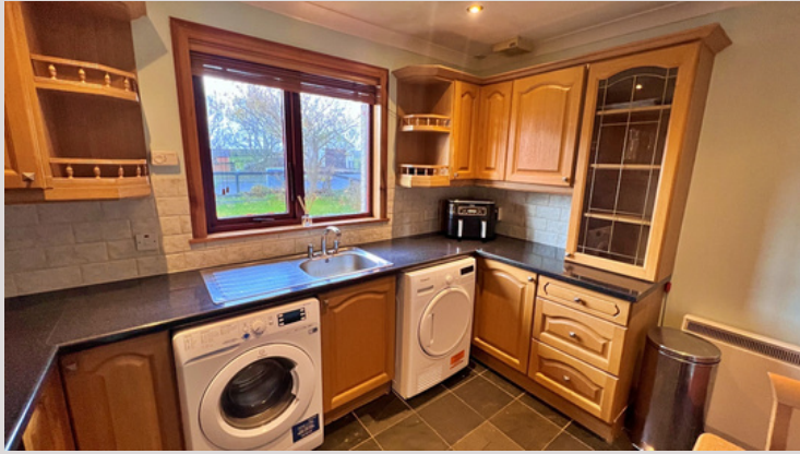
Kitchen - 2.52m x 3.30m