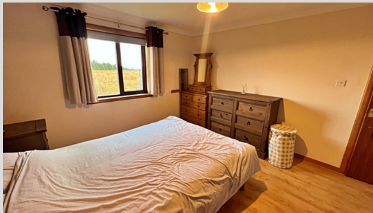
Bedroom 2 - 2.35m x 3.32m