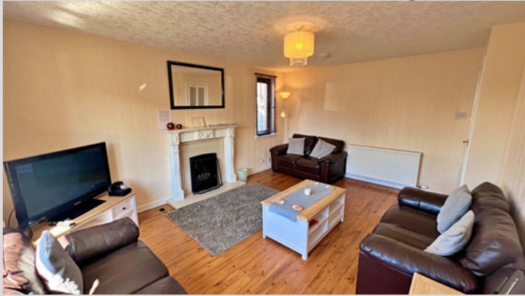
Lounge - 3.66m x 4.95m