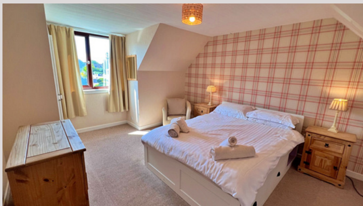
Bedroom 3 - 2.99m x 4.58m