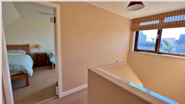
Bedroom 2 - 3.61m x 4.61m