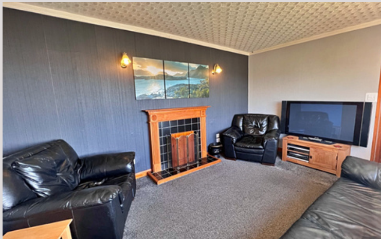
Lounge - 4.46m x 3.61m