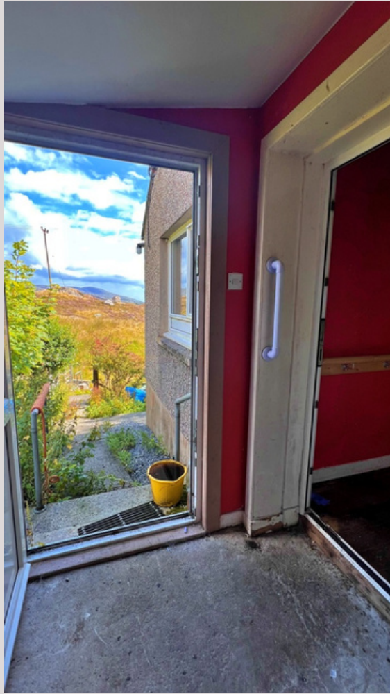
Hallway - 4.88m x 2.30m